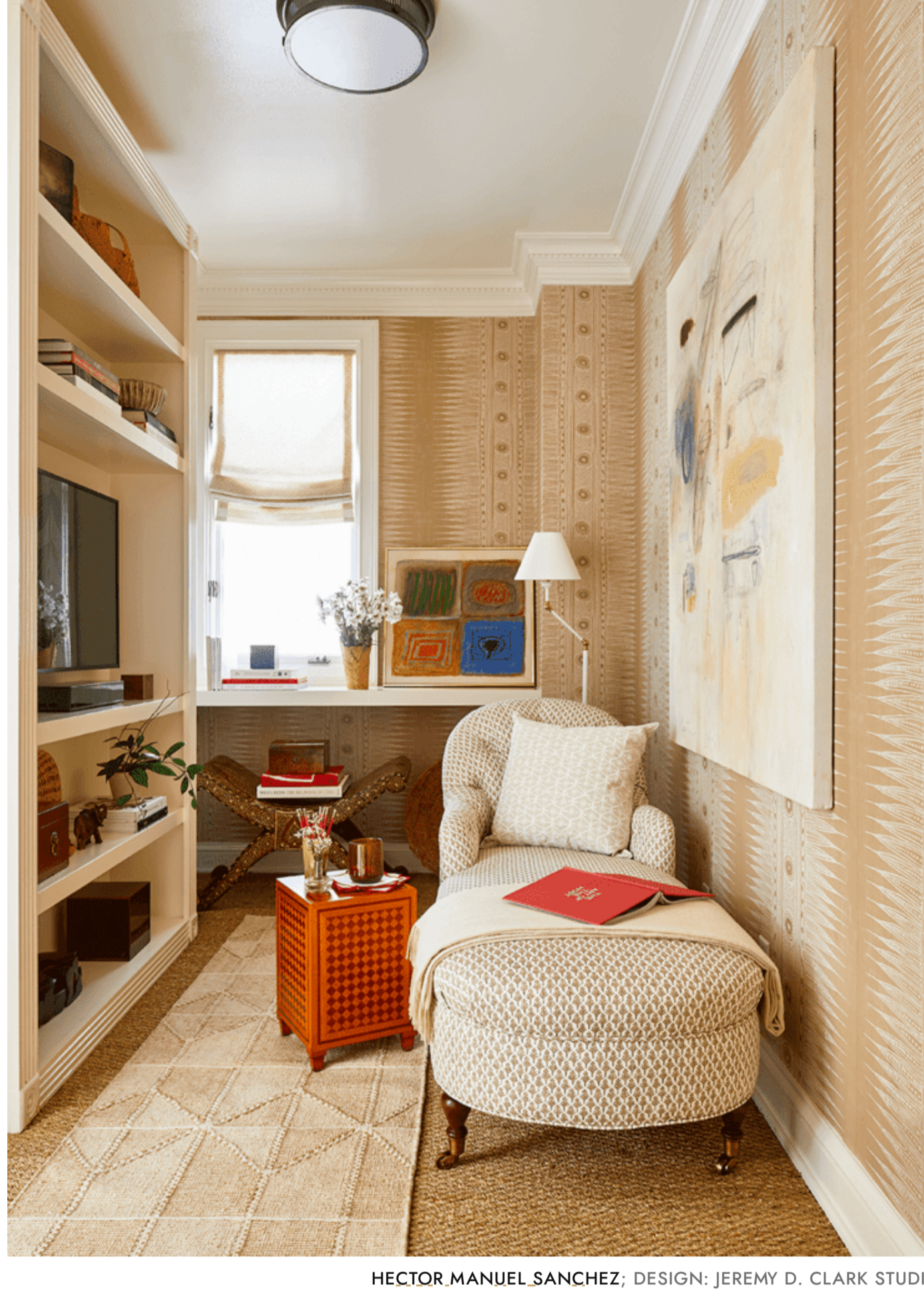
DESIGN: JEREMY D. CLARK STUDIO